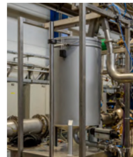
Electronic scale 150 kg

Our calibration facility is certified according to ISO 9001 and ISO EN 17025; all calibration results are NIST traceable.