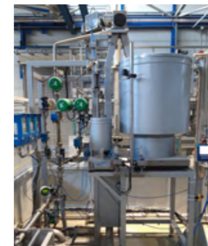
Electronic scale of the smallest bench