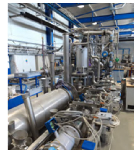
Middle test bench with scale covering low flows